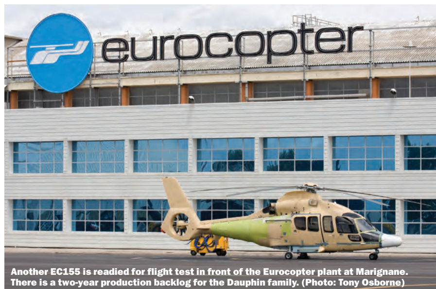
Another EC155 is readied for flight test in front of the Eurocopter plant at Marignane. There is a two-year production backlog for the Dauphin family.

Aérospatiale worked to improve the design, and the AS365 N (for 'Nouvelle') flew for the